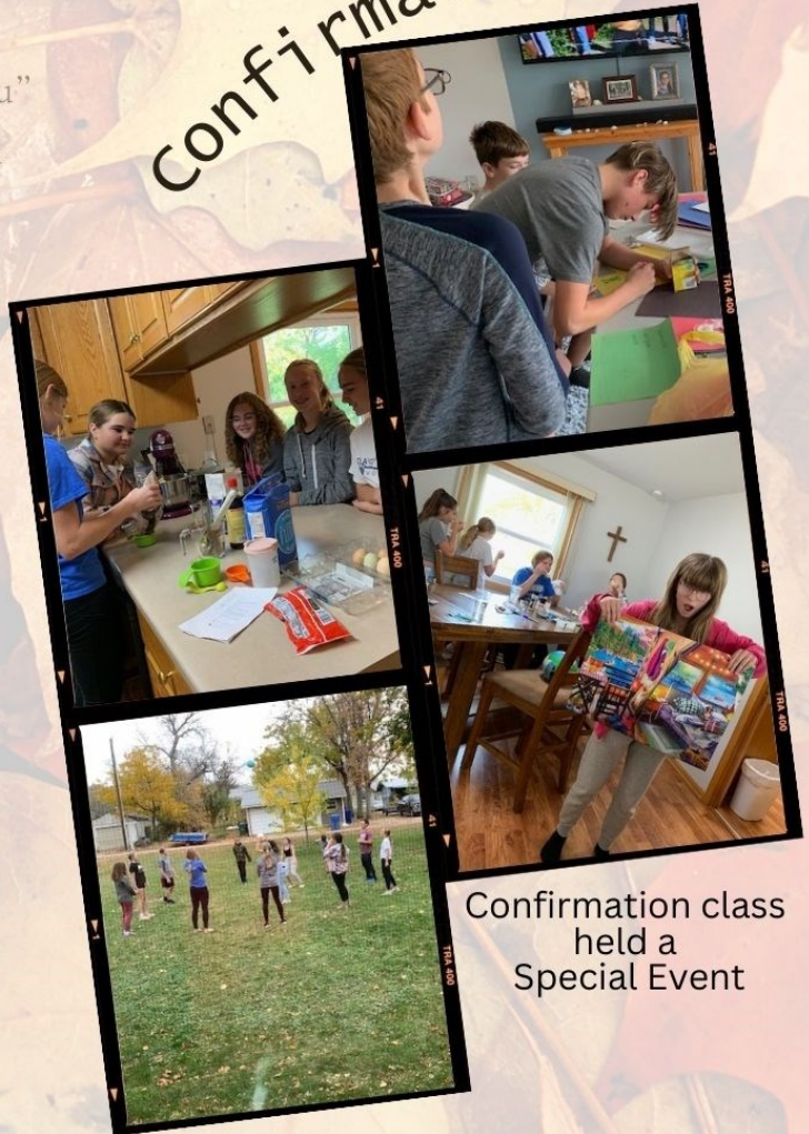
Confirmation class held a Special Event