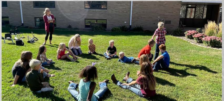
More pictures from Rally Sunday!